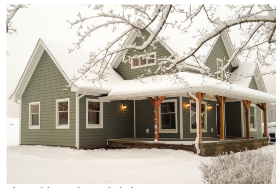
The Cold Weather Rule helps existing consumermembers maintain electric services during the winter.

To prevent disconnection when it is 35 degrees or above, or to be reconnected regardless of temperature, you must make payment arrangements with Rolling Hills Electric.